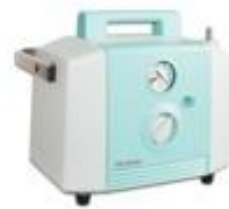
Victoria Portable with eurorail